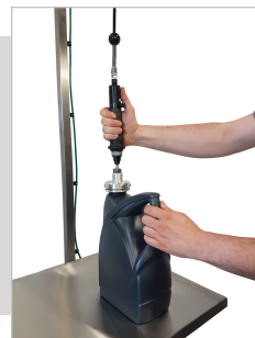
Screwing - head with lugs