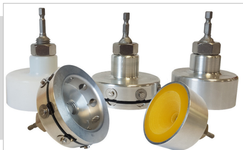
Screwing heads adapted to your caps