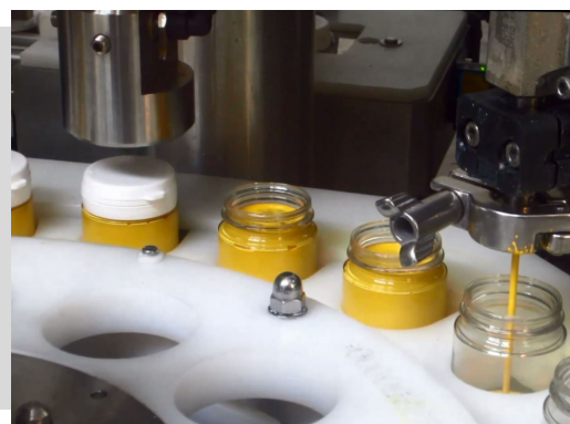
1 filling head and 1 screwing head monobloc